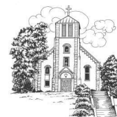
St. John the Baptist, Miltonsburg founded 1841