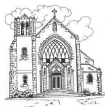
St. Sylvester, Woodsfield founded 1866