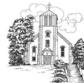
St. John the Baptist, Miltonsburg founded 1841