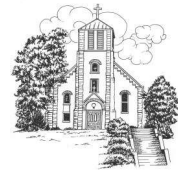
St. John the Baptist, Miltonsburg founded 1841