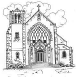
St. Sylvester, Woodsfield founded 1866