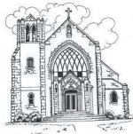
St. Sylvester, Woodsfield founded 1866