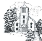
St. John the Baptist, Miltonsburg founded 1841