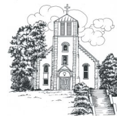
St. John the Baptist, Miltonsburg founded 1841