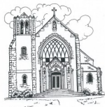
St. Sylvester, Woodsfield founded 1866