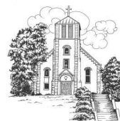
St. John the Baptist, Miltonsburg founded 1841