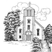
St. John the Baptist, Miltonsburg founded 1841